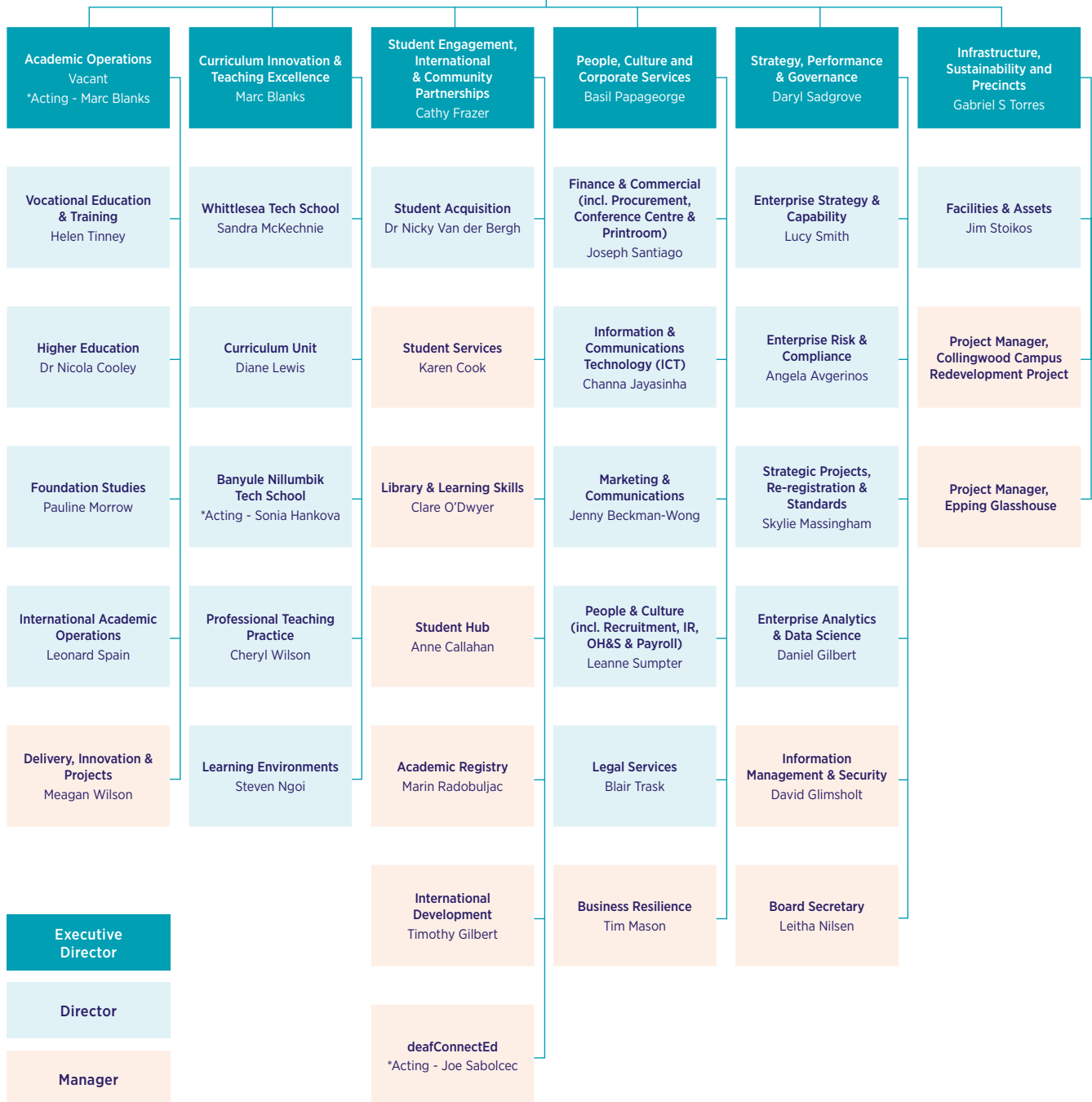
Organisational Chart Office of the Chief Executive 31 December 2021